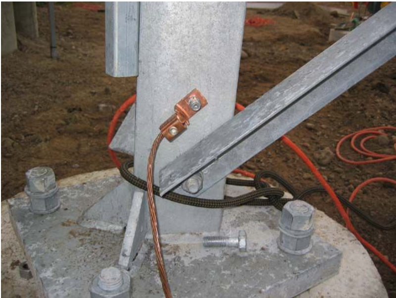
Figure 5.2: A tower with a heavy copper grounding wire.

The only natural predator of wireless equipment is lightning. There are two different ways lightning can strike or damage equipment: direct hits or induction hits. Direct hits are when lightning actually hits the tower or antenna. Induction hits are caused when lightning strikes near the tower. Imagine a negatively charged lightning bolt. Since like charges repel each other, that bolt will cause the electrons in the cables to move away from the strike, creating current on the lines. This is much more current than the sensitive radio equipment can handle. Either type of strike will usually destroy unprotected equipment.